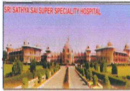
SRI SATYA SAI BABA SUPER SPECIALITY HOSPITAL

01 Name of the Gram Panchayat : Puttaparthi