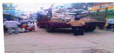
Removing of rubbish