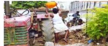
Removing the debris