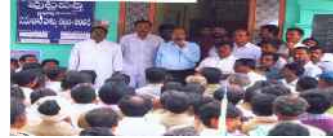
D.P.O. Anantapur addressing the sanitation staff