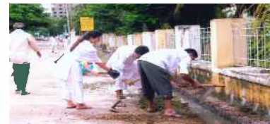
Foreign Devotees Participating in sanitation work