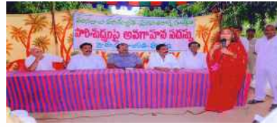
Awareness programme on sanitation

09 Sanitation:- The area of Puttaparthi Gram Panchayat is being cleaned every day. The town of Puttaparthi Main roads are being cleaned twice every days. 58 contract basis workers are regularly working for sanitation. Besides them local labour also being engaged whenever necessary to carryout the work Two Tractors on hire basis and 12 own Tricycles are being utilized for sanitation. House to house garbage collection is being takenup in Puttaparthi town by utilizing 12 tricycles to transport the garbage to compost yard, two tractors are being utilized. The Gram Panchayat is taking good efforts under the leadership of Sarpanch to keep the Puttaparthi town as a clean town. Recently during November 2010 on the occasion of Bhagawan Sri Satya Sai Baba's Birthday, sanitation Programme is takenup with 450 people for 10 days from 16.11.2010 to 25.11.2010