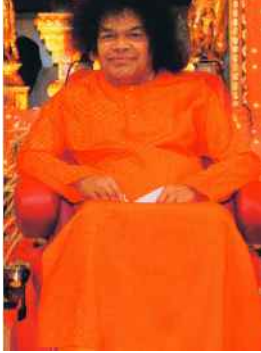
SRI SATYA SAI BABA GARU